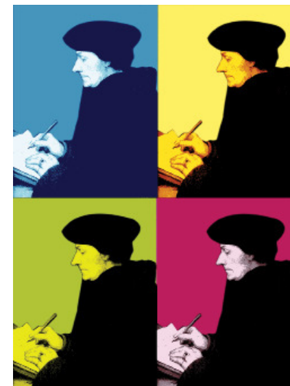
Desiderius Erasmus Roterdamus (1466–1536)