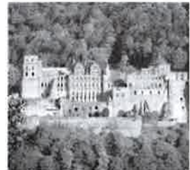
Emma-2: Icing the cake Emma-East and Emma-V partners meet in Heidelberg May 19th to 21st 2014